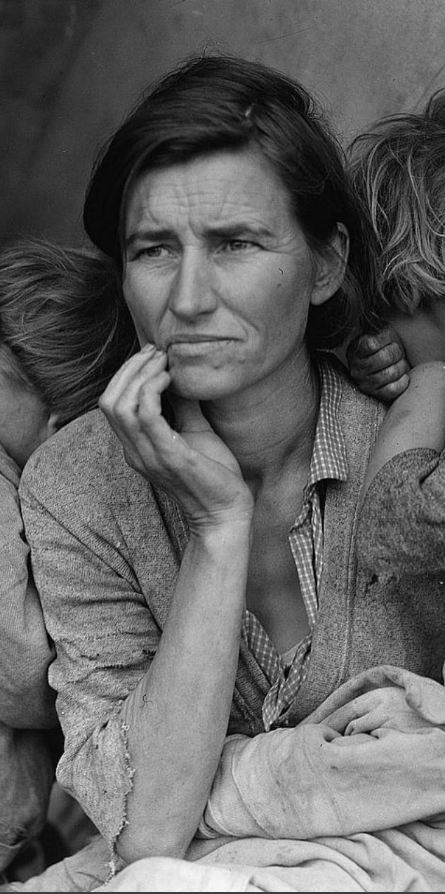
Documenting the Face of America

whales. By the time mother and offspring return to Hawaii for the winter, the young humpback will be ready to set out on her own and find her own place in the community of whales. (HD)