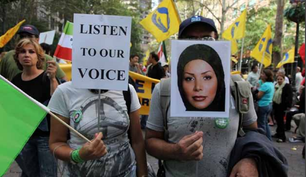
Frontline A Death in Tehran