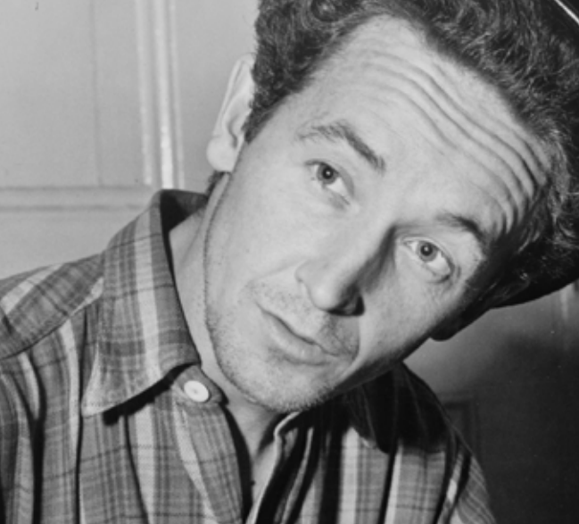
American Masters Woody Guthrie: Ain't Got No Home