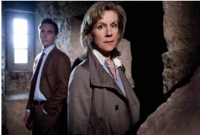
Masterpiece Contemporary Place of Execution, Part 1